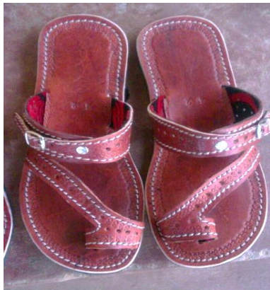
Figure 2 Shoes designed and made by Nunda Youth Group, Kilifi.