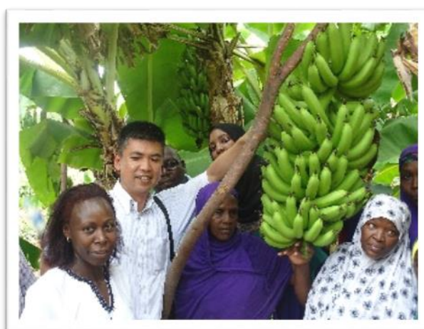
PSC Members on monitoring visit at one of the Handaraku Women Group farm, Tana River County.