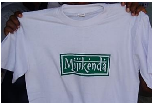
Figure 1 Screen printed shirt made by Katambalos Youth Group, Kilifi

able to effectively participate in local economic activities and generate additional income for their households. This has reduced their vulnerability to impacts of disasters and potential for radicalization.