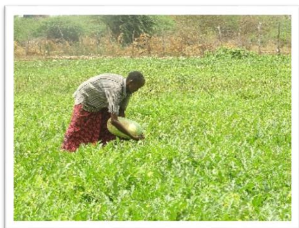
A farmer harvests water melon at Mandigo Women group farm, Tana River County.

Disaster Risk Reduction Consultative Forums: The project strengthened County DRR and resilience platforms through a consultative forum which enabled experience sharing and networking. The forum brought together a total of 149 (34 female, 115 male) participants drawn county DRR platforms and other organization concerned with community resilience within the county. Through the forum, the participants reviewed county contingency plans; reviewed the roles and responsibilities of the county disaster committees, county governments and communities in disaster risk reduction and revised the county action plans for DRR.