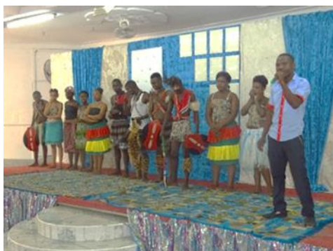
Figure 3 Exodus youth group, Kilifi: The group promotes peace messaging through theatre and film.

The project supported 29 groups from 3 counties (Kilifi, Kwale and Tana River) with various livelihoods and value addition initiatives. The project invested a total of US$ 115,000 with each group getting an average of US$3,955 worth of equipment and inputs. The businesses the groups are engaged in include: leather value addition, coconut oil production, furniture making, tailoring, poultry keeping, beekeeping, livestock trade, screen printing among others. During the implementation period the groups registered good progress and returns which was used to supplement household income are well as expand their businesses. 12 out of the 29 groups realized total earning of US$122,311 against the project investment of USD115,000 during the 1-year